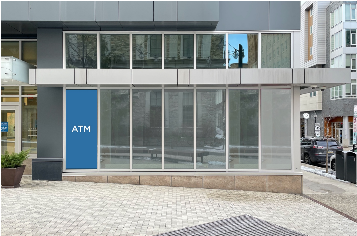
Image of Windows